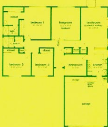
Plan 823—The Valley View 1520 square feet, 3 bedrooms, 2 baths

After you have counted the special features and luxury touches of this home you will expect the price to be beyond your budget. But that isn't so. Here is attainable luxury. The long family room with cathedral ceiling is splendid expanse for "gatherings of the clan." As you amble down the long central hallway, pause and admire the formal sunken living room. In the "just right" bedroom wing, note the size and careful placement of the closets, and the dressing area in the master bedroom suite. The bathrooms, with cultured marble vanities, ceramic tile and linoleum floors are another delight. All in all, this home is ideal for every growing family.