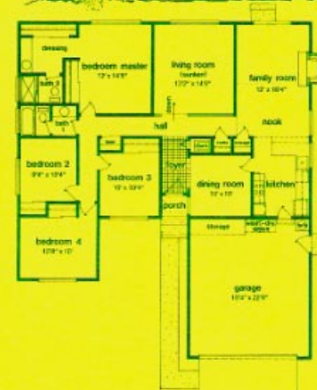
Plan 824—The Valley Ridge 1657 square feet, 4 bedrooms, 2 baths

Here's an all-occasion home; an every-convenience-design, with luxury touches to gladden any heart. To mention a few conveniences, observe the recessed entry for added weather protection, look into the big double garage with its storage area. Your need for formal space finds classic expression in the